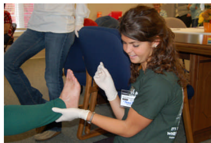
W&L students give foot exams to all the patients.